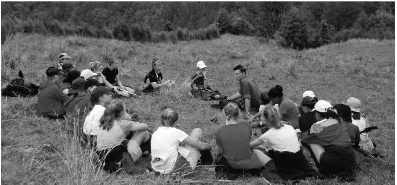
Editors Note: Refer to the back page photo collage for a pictorial view of the activities offered at Kahunui

Kahunui is in its second year of operation and the group of dedicated and passionate staff are refining the programme and processes. The centre has just passed Outdoorsmark a real achievement for a centre that has only been in operation for a year and half.